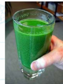
Blue-green algae

The bigger question is - why would we add to the amount of contamination that we pay a water utility to clean?